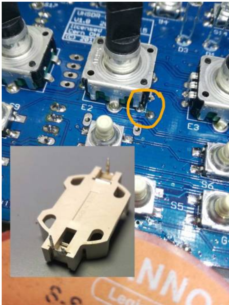
Potential Shortcut