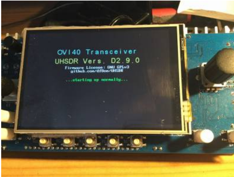
Boot loader splash screen at start up

Please also check boot loader version number displayed in system menu corresponds to the version you intended to install.