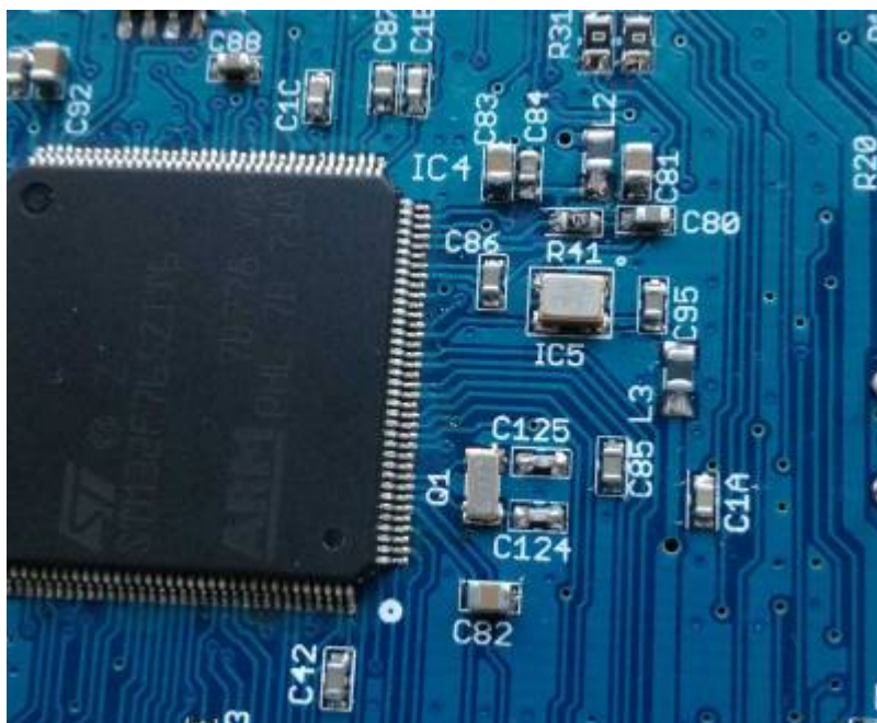
Orientation of TXCO & MCU

Please understand the correct orientation of STM32 MCU Pin 1. There are two markings on the IC. Please not the text printed on MCU to find the correct Pin 1: When reading the text Pin 1 is on bottom left corner.