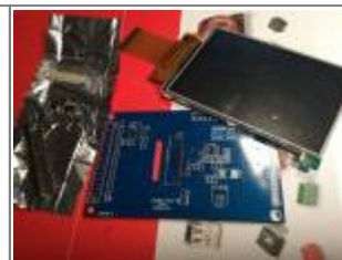
Display board