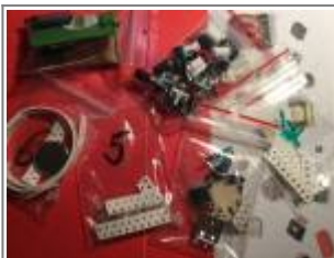
Components in bags

The kit contains UI V1.8 PCB, components in bags and packing list. The display is delivered as assembled and tested unit.