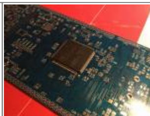
UI V1.8 PCB