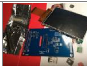
Display board